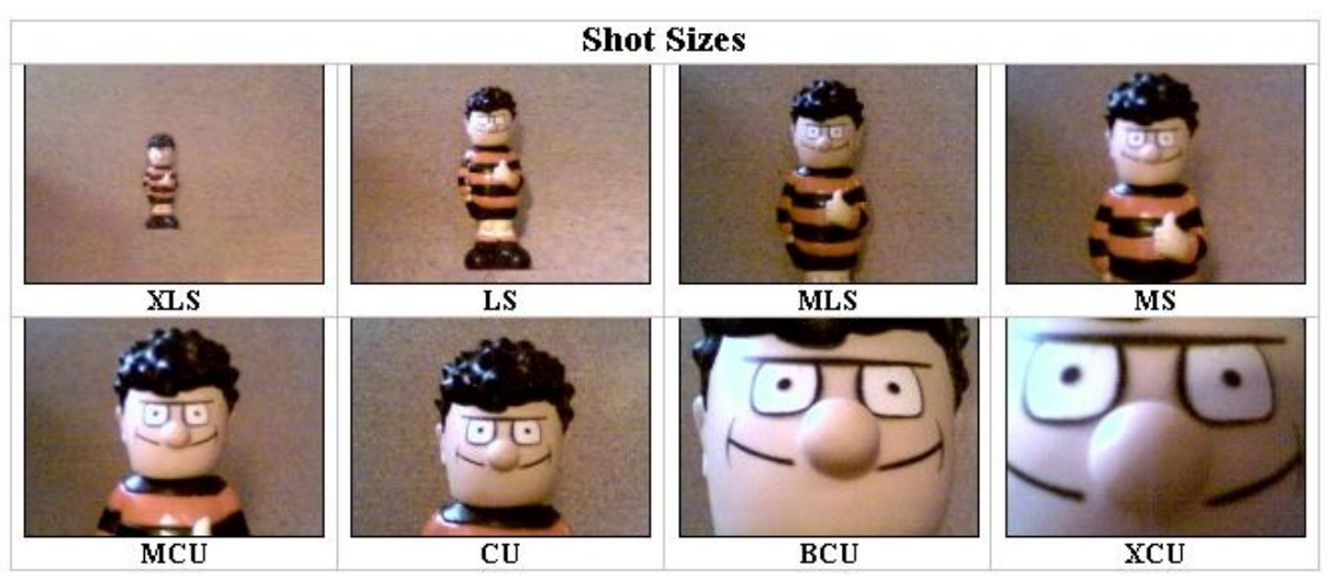
Images and text (c) 2001 Daniel Chandler - no unauthorized use - this image is watermarked

Long shot (LS). Shot which shows all or most of a fairly large subject (for example, a person) and usually much of the surroundings. Extreme Long Shot (ELS) - see establishing shot: In this type of shot the camera is at its furthest distance from the subject, emphasising the background. Medium Long Shot (MLS): In the case of a standing actor, the lower frame line cuts off his feet and ankles. Some documentaries with social themes favour keeping people in the longer shots, keeping social circumstances rather than the individual as the focus of attention.